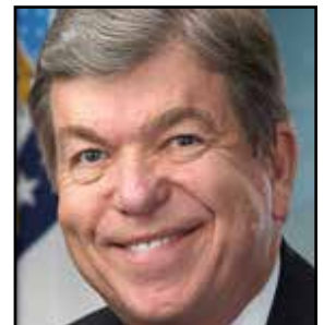
Missouri Senator, Roy Blunt

Additionally, MACA met with numerous organizations to increase education and awareness, including: Hallmark Foundation, Kauffman Foundation, Washington University, Ascension Health, and H&R Block.