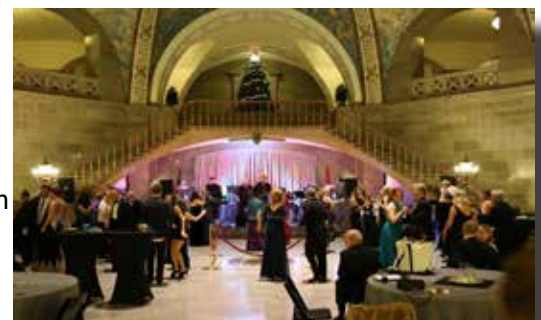
Caring for Missouri Capitol Masquerade Ball, dancing in the first floor rotunda

More than 450 Missourians attended the first ever Capitol Masquerade Ball in Jefferson City. The evening raised nearly $150,000 to benefit three charities, the Missouri State Capitol Commission (MSCC), Missouri Coalition Against Domestic and Sexual Violence (MCADSV) and Missouri Association for Community Action (MACA). This was the first fundraiser for the Network. The MACA Board will direct the use of these unrestricted funds for local agency needs.