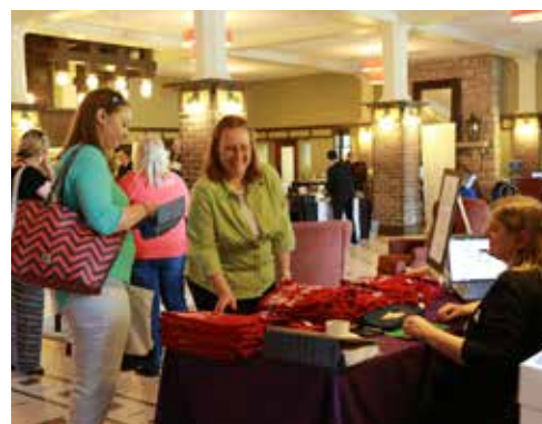
Conference attendees purchasing Community Action t-shirts in the lobby of the Elms Hotel