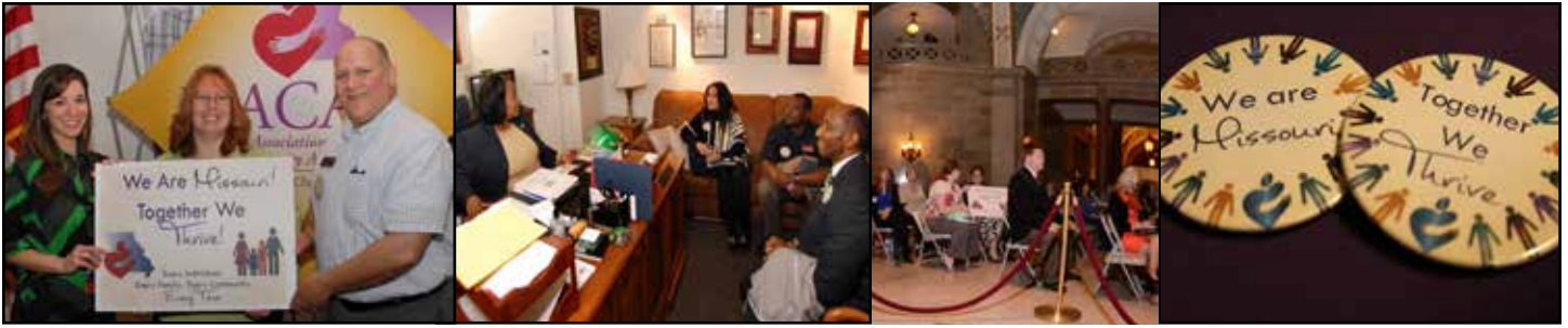
Photos from MACA's 2015 Advocacy Day